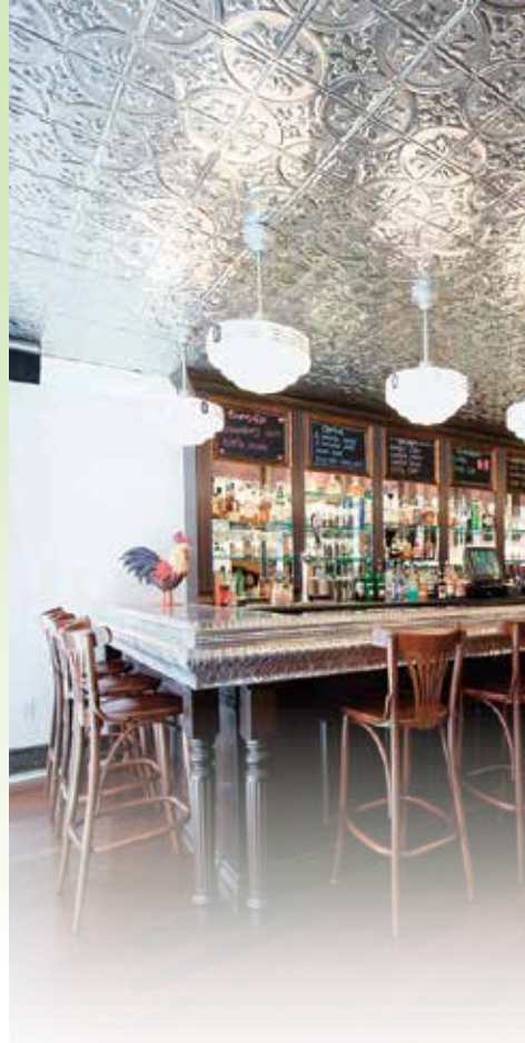
Bistro Lecoq, Halifax | Design 360 Inc.

As well, on some projects an Interior Designer may: