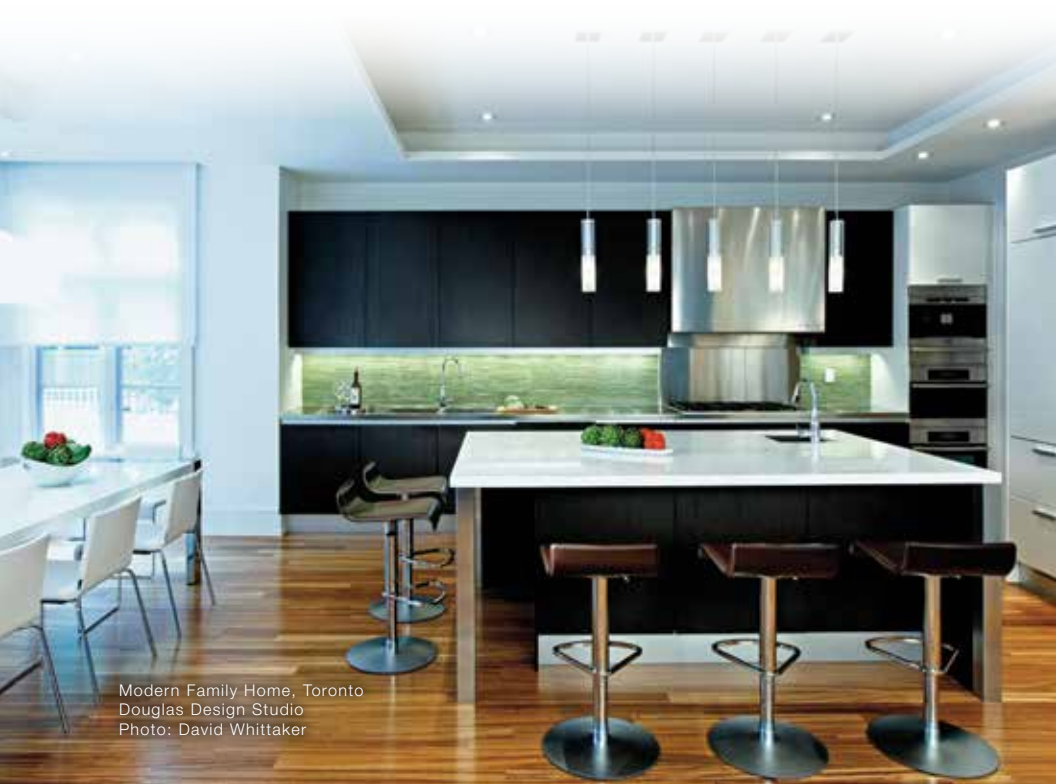
Modern Family Home, Toronto Douglas Design Studio

If you need any assistance finding a professional interior designer for your project, please contact IDC at 1.877.443.4425 or info@idcanada.org .