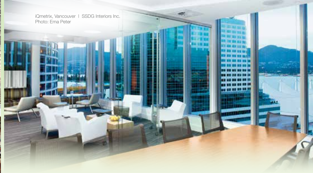
iQmetrix, Vancouver | SSDG Interiors Inc.